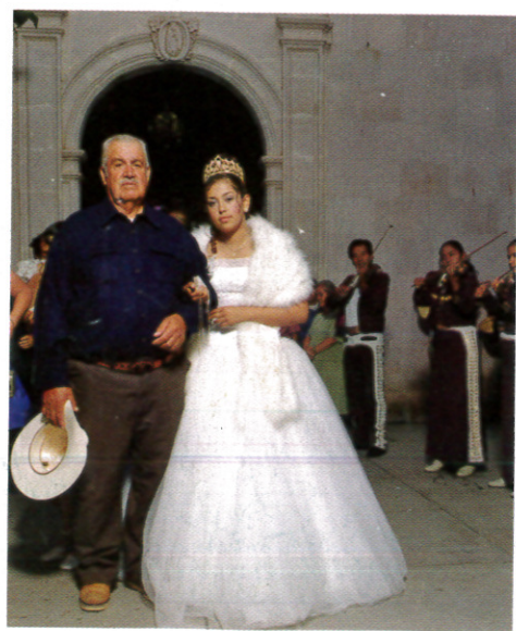
A quinceañera is a traditional celebration for 15-year-old girls in Mexico and other Latin American countries, marking their passage into womanhood. The day of the quinceañera often begins with a mass and concludes with a formal dinner and dance.